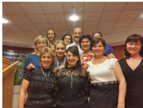
Group from the University of Debrecen at the HSPOG Congress