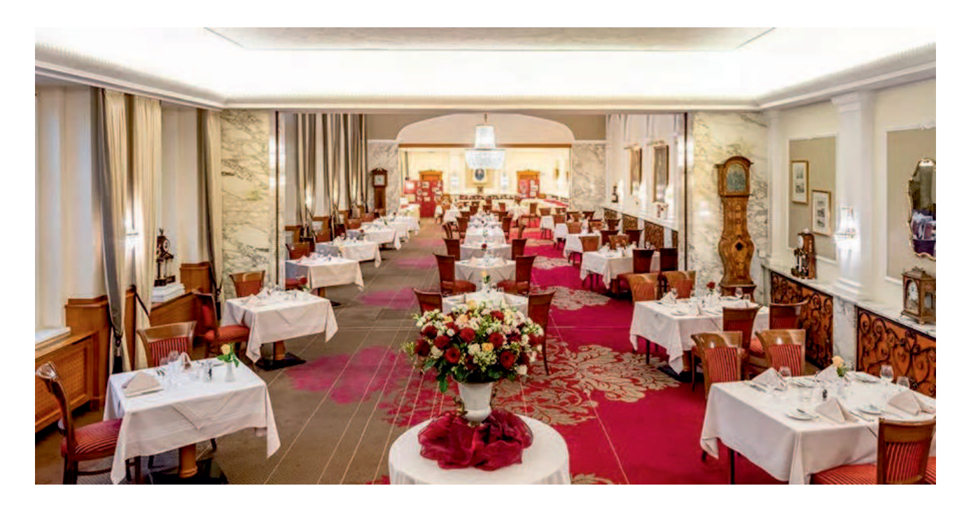
The ballroom of the Hotel Stefanie in Vienna

Cost: 60,- €/person (incl. buffet, without drinks), registration required